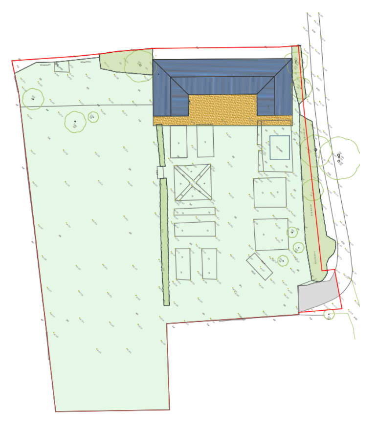
Figure 2 – Proposed site plan